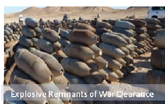
Explosive Remnants of War Clearance