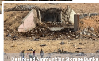
Destroyed Ammunition Storage Bunker